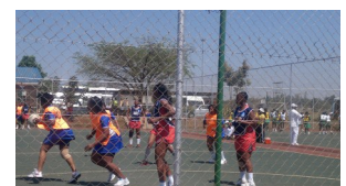
Netball players of Emthanjeni playing against Ethekewini Municipality.

The Municipality is planning on increasing the Sports Codes to accommodate all Employees as this is part of the Wellness Program of the Municipality.