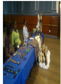
Emthanjeni crafters .

Lastly, tourism should be a contact between the tourists and host, between different cultures, people and places, let us explore what Emthanjeni Municipality has to offer tourists and support domestic tourism.